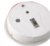
Model i12080 120V AC/DC Wire-in Smoke Alarm with Safety Light