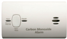
Model KN-COB-B-LPM Carbon Monoxide Alarm Battery Operated