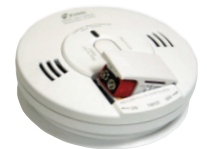
Model KN-COPE-I AC Wire-in Combination Carbon Monoxide and Photoelectric Smoke Alarm