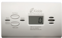
Model KN-COPP-B-LPM Carbon Monoxide Alarm Battery Operated with Digital Display