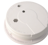
Model i12040 120V AC/DC Wire-in Smoke Alarm with Battery Backup