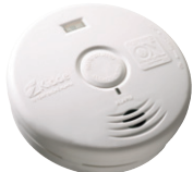
Model C3010H Hallway Smoke Alarm with Safety Light