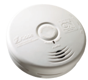
Model P3010K-CO Kitchen Smoke and Carbon Monoxide Alarm