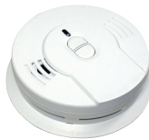
Model i9010 Sealed Battery Smoke Alarm with Hush™