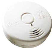
Model P3010L Living Area Smoke Alarm