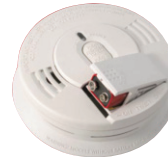
Model i12060 120V AC/DC Wire-in Smoke Alarm with Front Battery Door