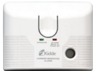
Model KN-COB-LCB-A Carbon Monoxide Alarm AC Powered, Plug-in with Battery Backup