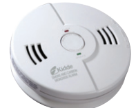
Model KN-COSM-IB AC Wire-in Combination Carbon Monoxide and Smoke Alarm