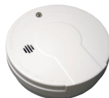
Model i9050 Battery Powered Smoke Alarm