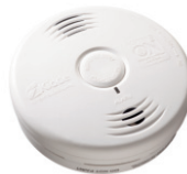
Model P3010B Bedroom Smoke Alarm with Voice Alarm