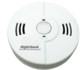
Model KN-COSM-XTR-B Battery Operated Combination Carbon Monoxide, Fire & Smoke Alarm